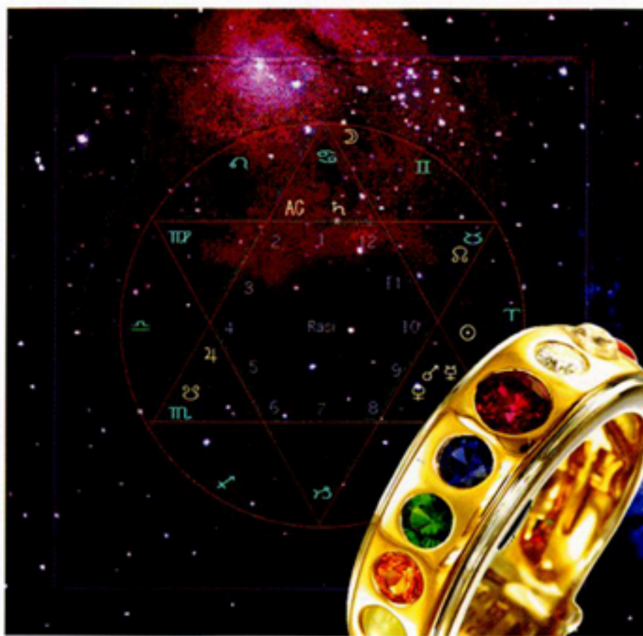
Horoscope Jyotish Art

Pratikul Planet's gem choosing method for