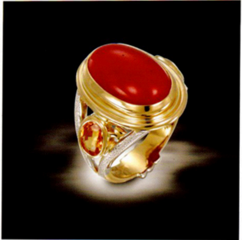
Mars Coral Ring

So ideal talismans for you are a ring with a