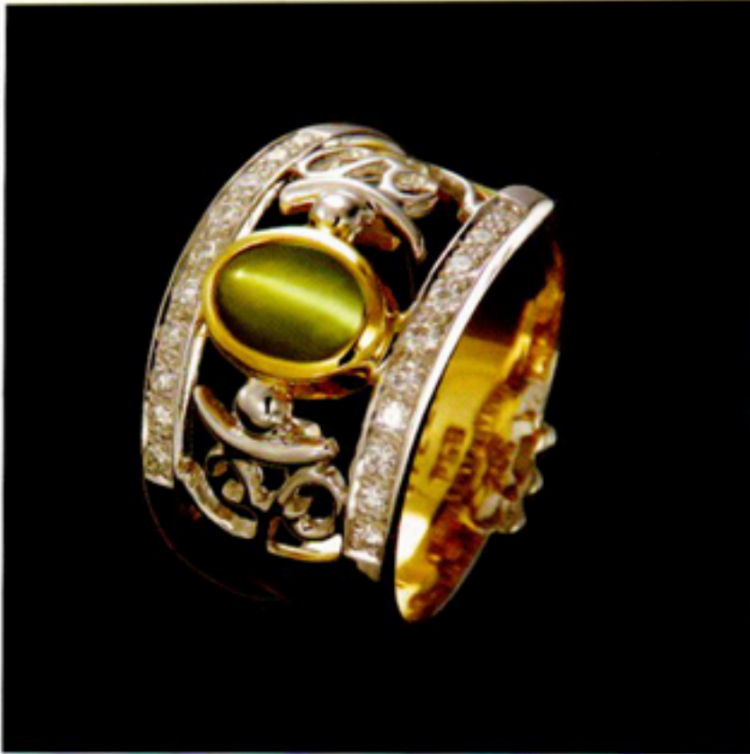
Ketu Catseye Ring

auspicious. Some persons opine that a harmful planet means that the planet's "cosmic colour" is weak.